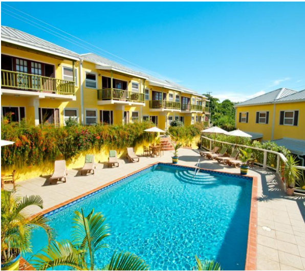
Grooms Beach Villas & Resort