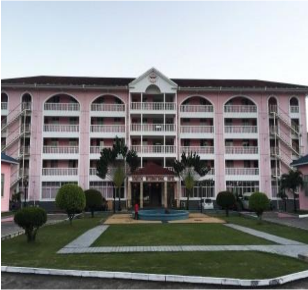
Sogeco International Hotel

NATIONAL ATHLETIC STADIUM, QUEENS PARK, ST. GEORGE'S, GRENADA MARCH 26 th – 28 th , 2016