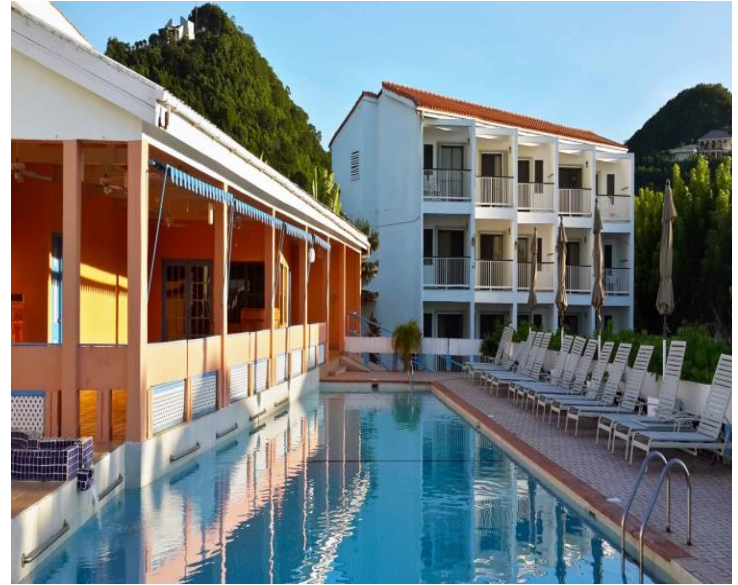
Allamanda Beach Resort