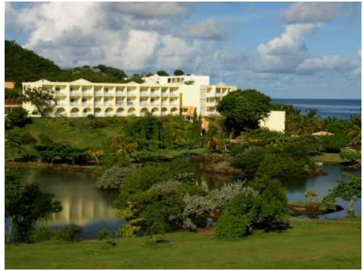
Grenadian by Rex Resort